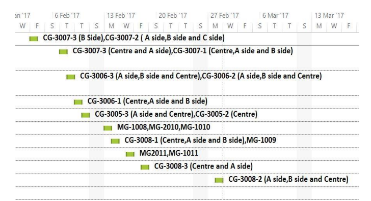
Fig.3: Gantt chart